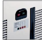
Front ON-OFF Switch Storage bin antibacterial pouch & holder