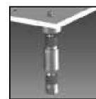
Hygienic scoop holder