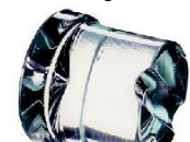
Ø 38 x H 41 mm

This product qualifies for the following listings: