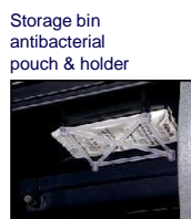
Storage bin antibacterial pouch & holder