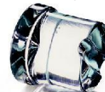
Ø 29 x H 34 mm