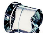
Ø 38 x H 41 mm

This product qualifies for the following listings: