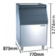
储冰量: 243kg Storage Capacity: 243kg