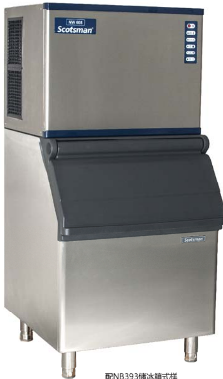
配NB393储冰箱式样 Shown on NB393 bin