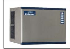
T304不锈钢面板 T304 Stainless Steel Panels