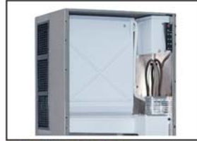
垂直蒸发器制冰系统 Vertical Cube System