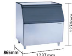
储冰量: 406kg Storage Capacity: 406kg