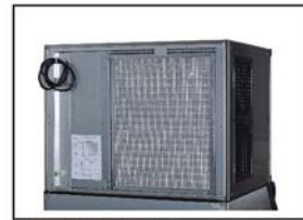
人性化的空气滤网 Proximity Condenser Air Filter