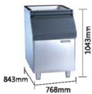
储冰量: 178kg Storage Capacity: 178kg