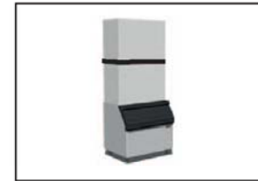
可机头叠加 (装置另购) Double Stack (Needs a stacking kit sold separately)