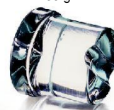
Ø 38 x H 41 mm

This product qualifies for the following listings: