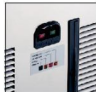
Front ON-OFF Switch Storage bin antibacterial pouch & holder